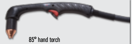
85° hand torch

Duramax Hyamp standard torch styles (for more torch options, see www.hypertherm.com )